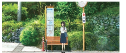
Nishi-no-tani Dai-ni bus stop

The model of the bus stop that Suzu uses to get to school. It is located in front of Nagoya Chinkabashi (Submersible Bridge).