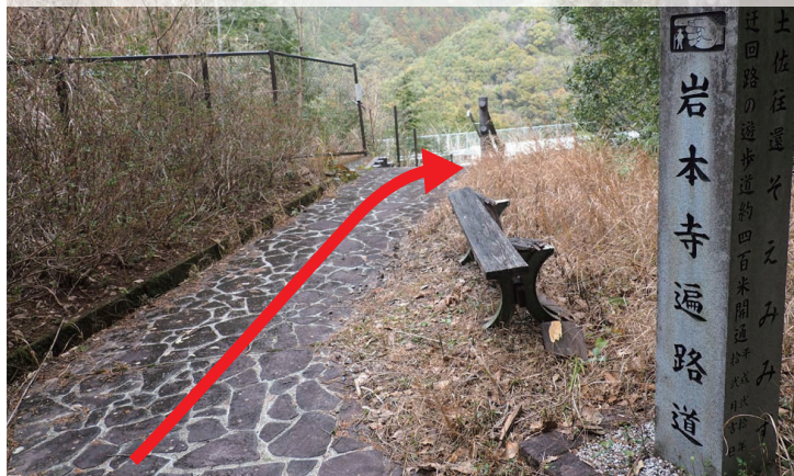
19 Go down the stairs.