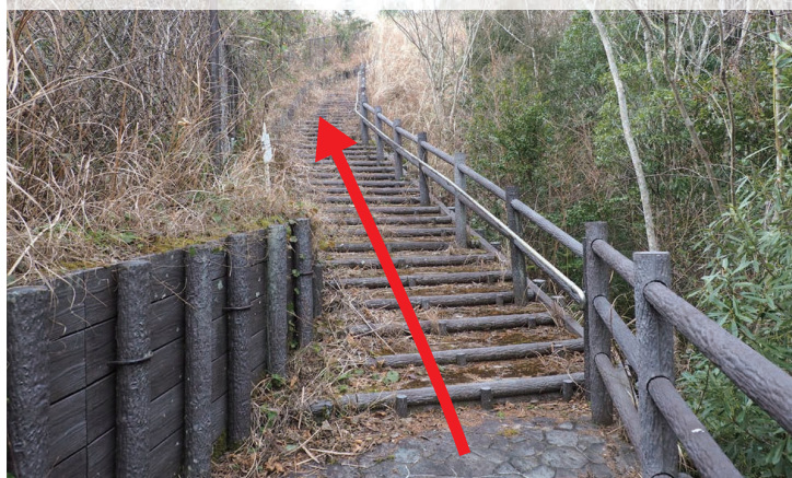
21 Go up more than 400 stairs.