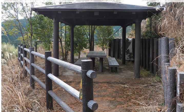
22 There is a rest stop along the way.