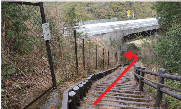
20 Go down the stairs and continue under the highway.