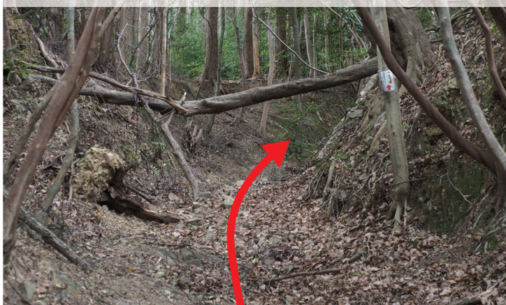
24 Go straight ahead, being careful of fallen trees.